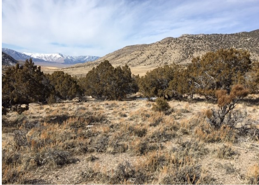
Prior to tree removal

Treatment area was about 10 acres. The majority of this treatment area was sparsely stocked and considered phase I. Contractor manually (i.e., chainsaw) sever and cut trees into manageable logs. This was funded by NDOW under their South Mountain Habitat Restoration project. Slash will be masticated this fall or winter using another funding source.