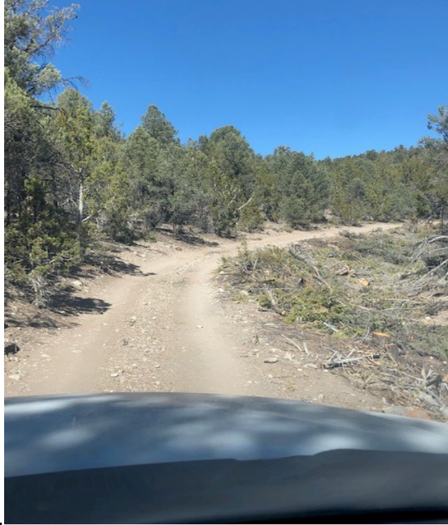
Cut pinyon and juniper on right